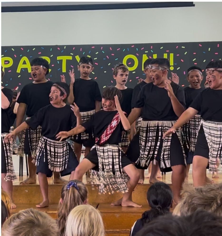
Kapa Haka at graduation ceremony