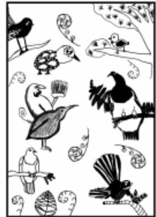
NATIVE BIRDS OF NEW ZEALAND WATERLEA SCHOOL CELEBRATING 65 YEARS IN 2019

Profits will go towards a new JUNIOR PLAYGROUND